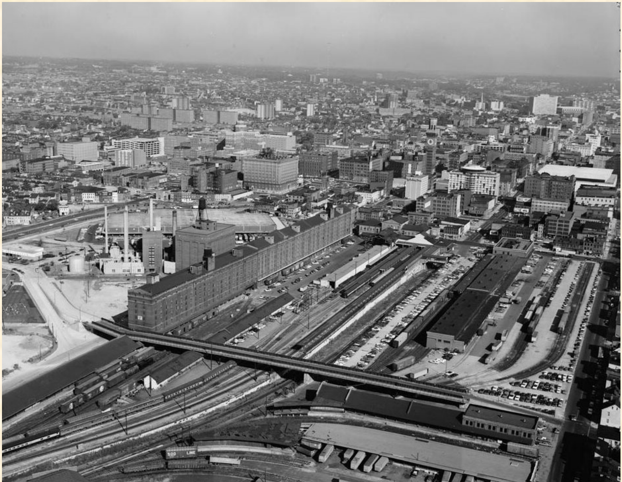
A photo of the area before the stadium was built.

Scroll down for a photo and some maps showing the area before and after the stadium was built.