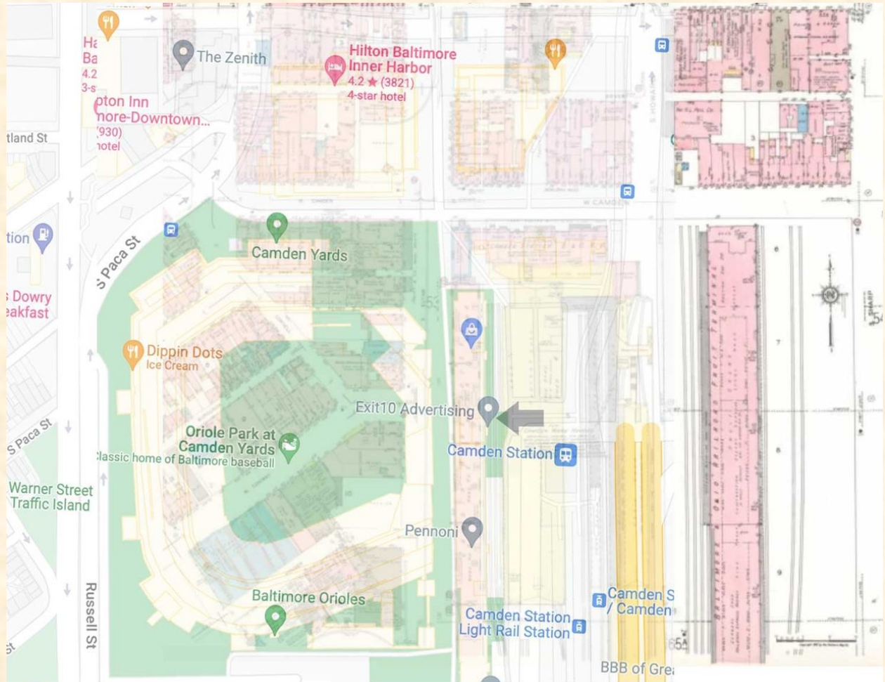
An overlay of Orioles Stadium on top of the 1950s map.